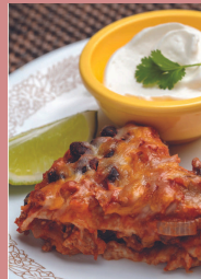
TACO PIE: TUES. MAY 14TH

CLASS TIMES ARE 12PM AND 6PM. CALL TO RSVP AND CHOOSE YOUR CLASS TIME.